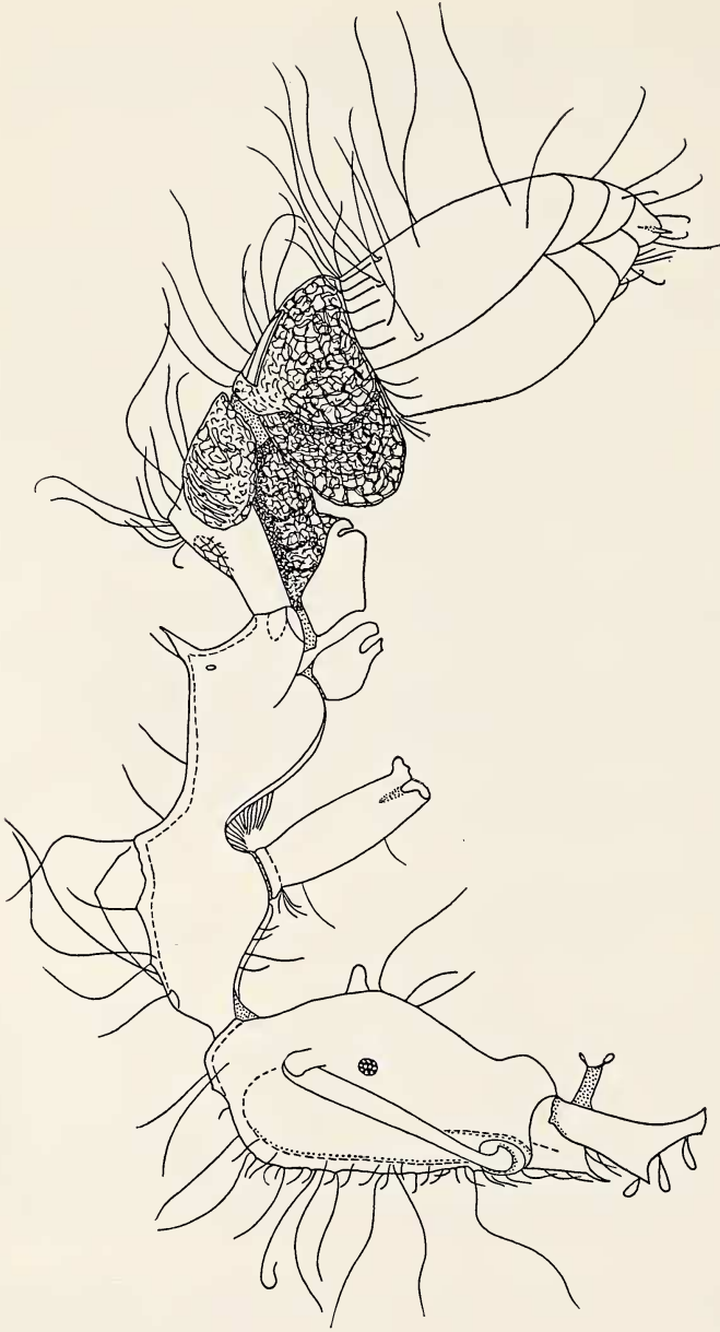
Fig. 1. Asketogenys acubecca new species, holotype worker, side view without legs. Drawn by Bente King.